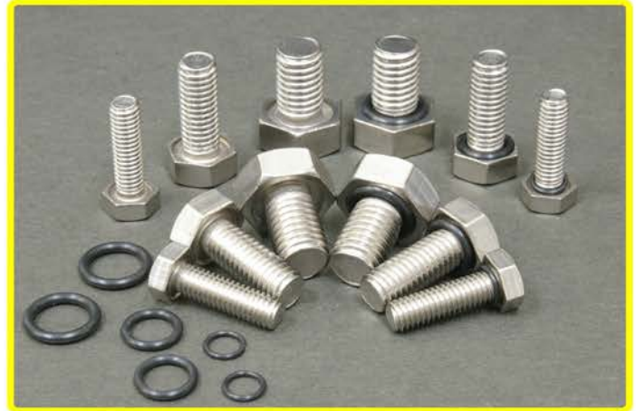
Hex Head Bolt